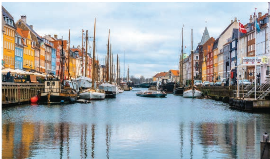
Nyhavn Canal in Copenhagen, Denmark