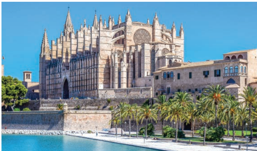
Palma Cathedral, Mallorca, Spain