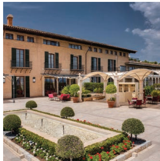
Castillo Hotel Son Vida