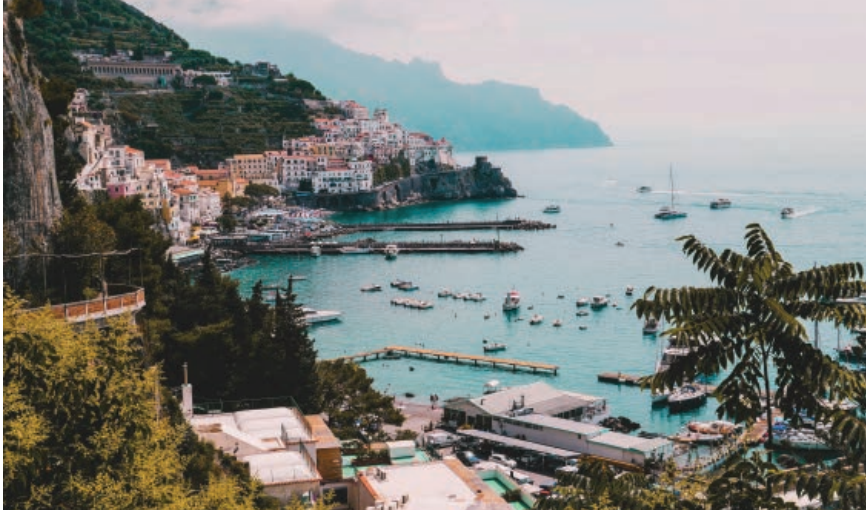
Amalfi Coast, Salerno, Italy