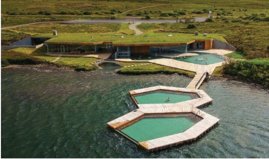
Vök Baths in Egilsstaðir, Iceland