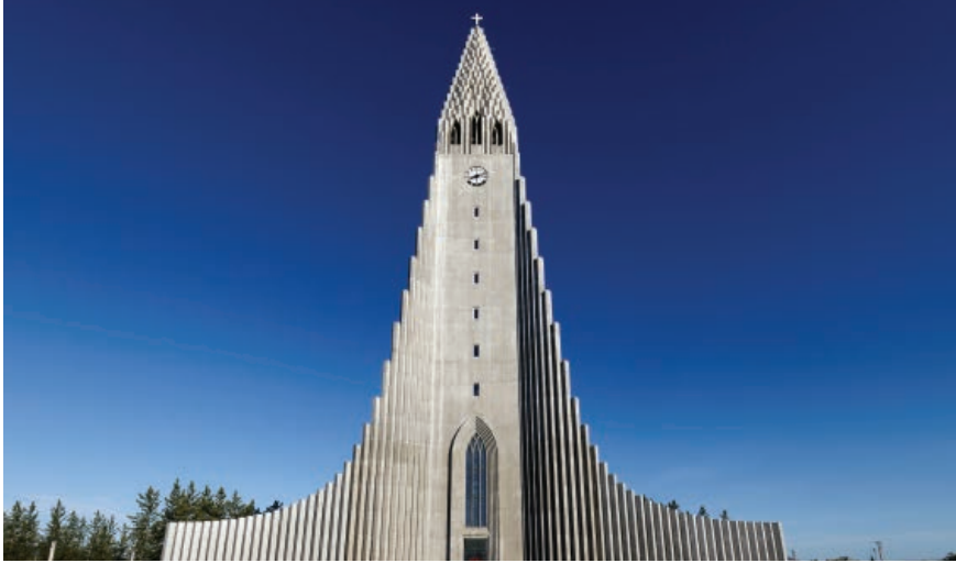
Hallgrímskirkja Church in Reykjavik, Iceland