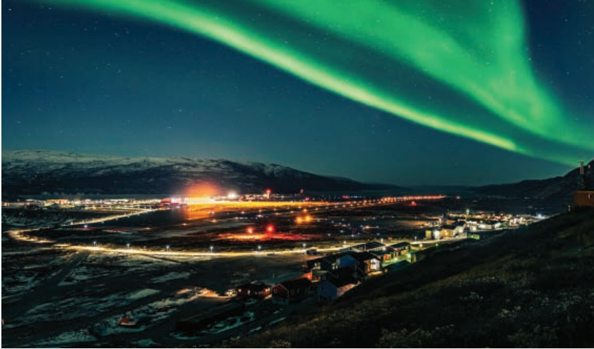
Northern Lights in Kangerlussuaq, Greenland