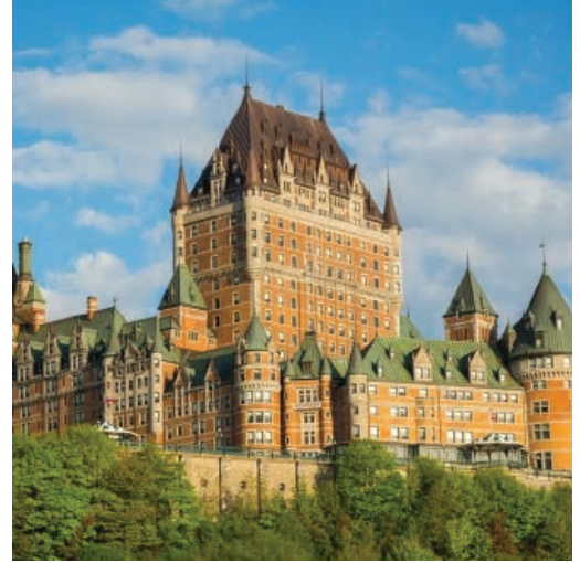
Fairmont Le Chateau Frontenac