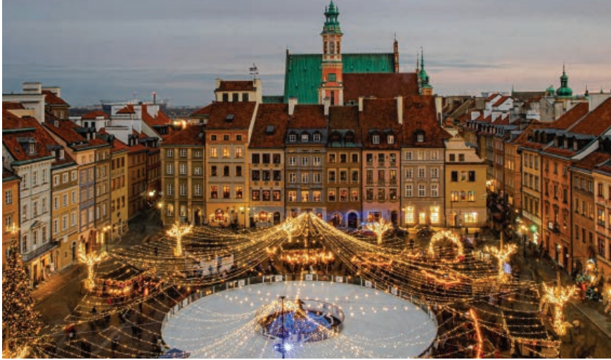
Warsaw Old Town, Warsaw, Poland