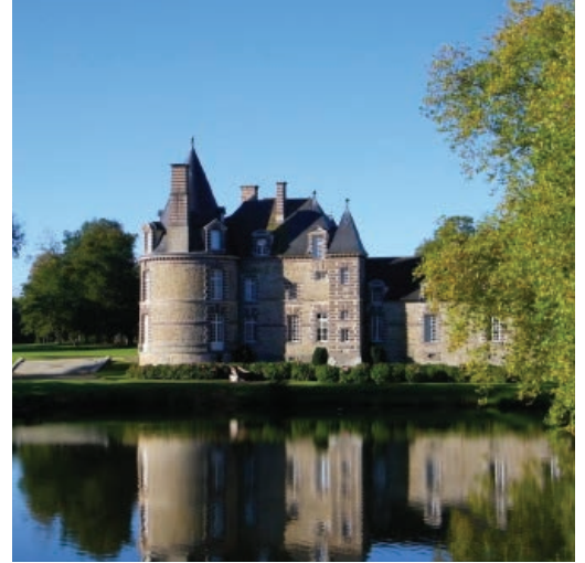
Hotel Chateau de Canisy