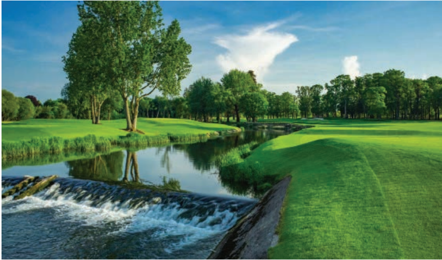
Golf course at Adare Manor in Shannon, Ireland