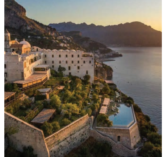
Monastero Santa Rosa