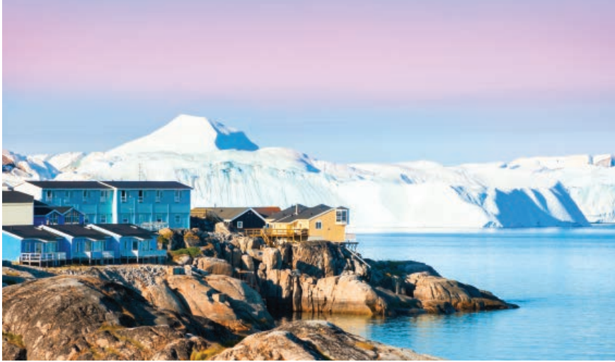
Shore of atlantic ocean with icebergs in Ilulissat, Greenland