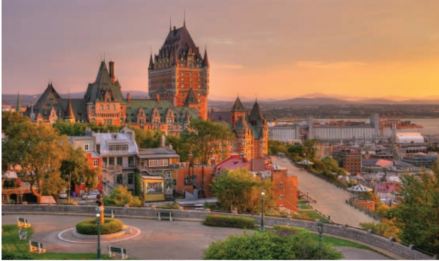
Quebec City, Canada