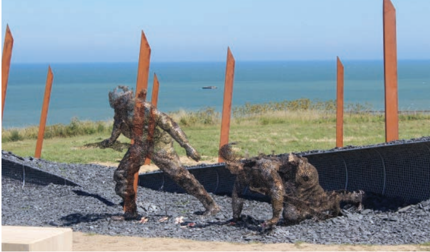
D-Day Beaches in Normandy, France