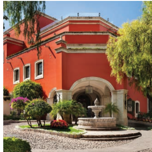
Rosewood San Miguel de Allende