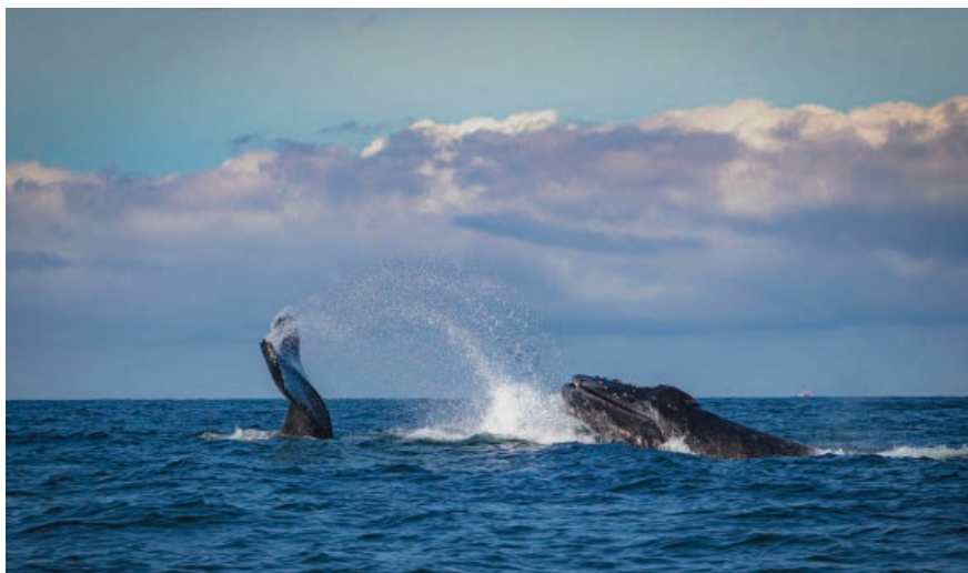
Humpback whales at the coasts of Puerto Vallarta, Mexico